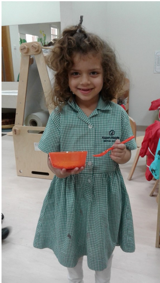
In mathematics we have been solving word problems. We have been using